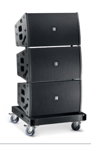
VHA406LND/LN VHA112FSND/FSN max 3 VHA-T 406