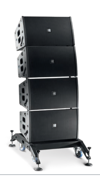
VHA406LND/LN x 3 VHA 12FSND/FSN VHA-T 406

The summit of the entire project is the 800+400W RMS amplification module with TCP/IP network interface. Based on the OCA ALLIANCE AES70 standard , it communicates with the 'INFINITO system management suite' remote control software and receives 24-bit 48-96Khz digital audio streaming from all devices compatible with the 'DANTE' standard . INFINITO is a true revolution in the FBT world that enhances the user experience, reaching new heights in terms of performance and simplicity! It is a software platform that is fully developed in house by the FBT R&D team that offers real time monitoring of the internal sensors and the status of the connected devices, fast IN/OUT Vu-meters, controls of all the parameters, group management and warnings readout. The module is contained in an aluminium chassis with intelligent forced ventilation and is equipped with an OLED display with encoder for parameter setting. A high-brightness blue front LED allows remote identification of the device also in daylight.