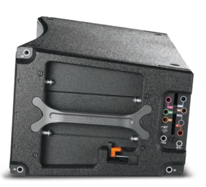
Practical aluminium handle

The MYRA 214L is Bi-Amped through a NEUTRIK NL4M connectors, one channel for LF and one for the MID/HF with internal passive crossover. The lowest octave of the Myra system is seamlessly reproduced by the companion 2185, a reflexloaded dual 18-inch subwoofer with custom designed, long excursion B&C woofers. Combining accurate cabinet resonance study and ingenious port arrangement which is designed to reduce turbulence and eliminate non-linearity, MYRA 218S delivers substantial low frequency energy down to 25Hz and can offer standard or cardioid directivity with suitable DSP preset and physical deployment. As with the 214L mid/high enclosure, the 218S cabinet benefits from premium Baltic plywood construction and to ensure long term road-worthiness and all-weather resistance, is protected by a durable polyurea coating. A two-point rigging system is flush-mounted into the cabinet, allowing the suspension up to 12 enclosures with a 4:1 safety factor. Trucking and handling are made easy by the eight comfortable, ergonomically placed rubber gripped aluminium bar handles, along with removable heavy-duty casters.