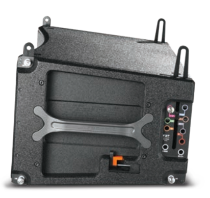
Intuitive four-point integrated rigging system