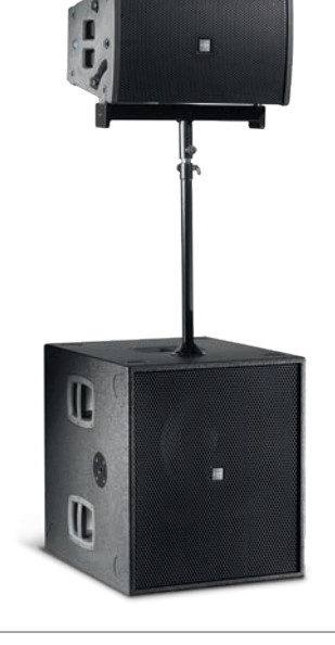
VHA406LND/LN VHA-S 406 VHA118SND/SN