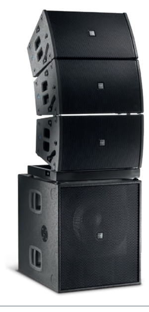
VHA406LND/LN x 2 VHA112FSND/FSN VHA-B 406 VHA118SND/SN